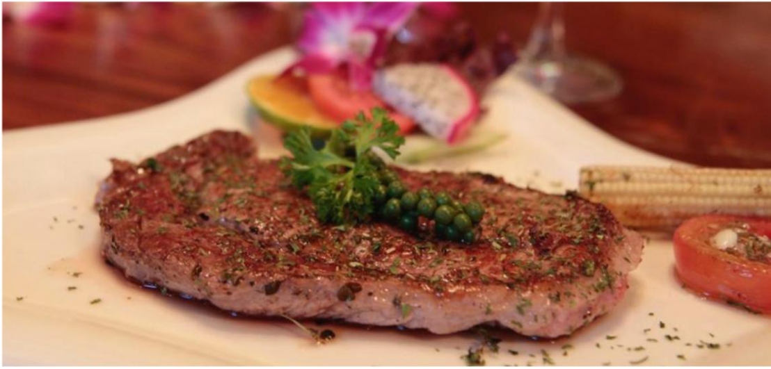
Rib eye 250 gr.