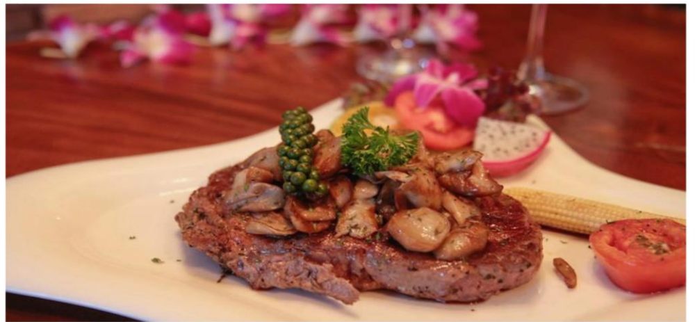
Mushroom Rib-eye 250 gr.