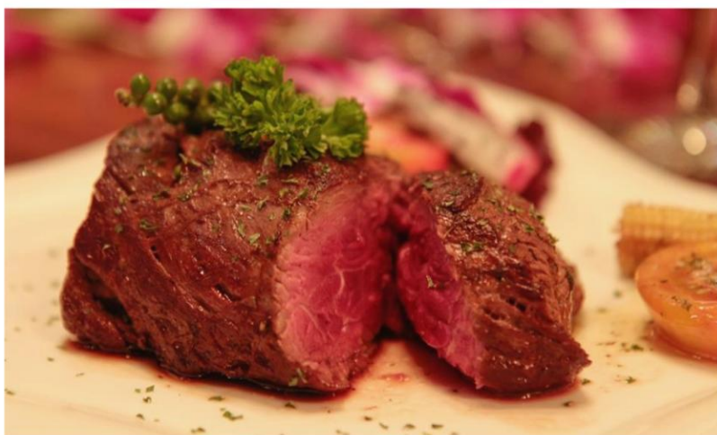
Tenderloin 300 grams (medium-rare)