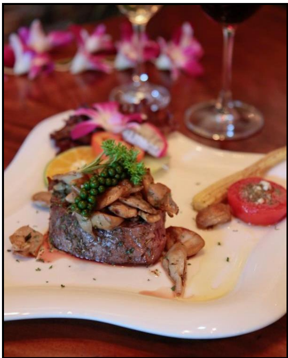
Mushroom Tenderloin 200 gr.