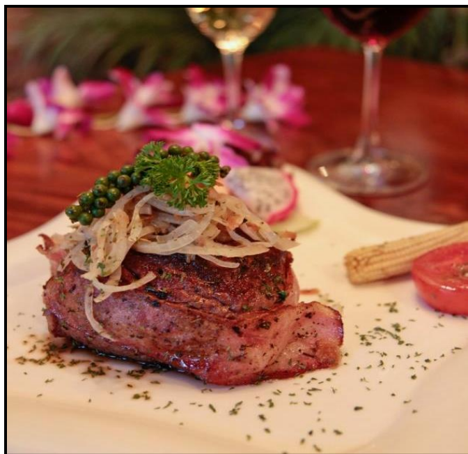
Carnivore Tenderloin 200 gr.