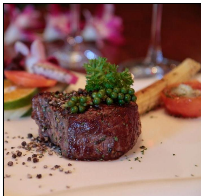
Pepper Tenderloin 200 gr.